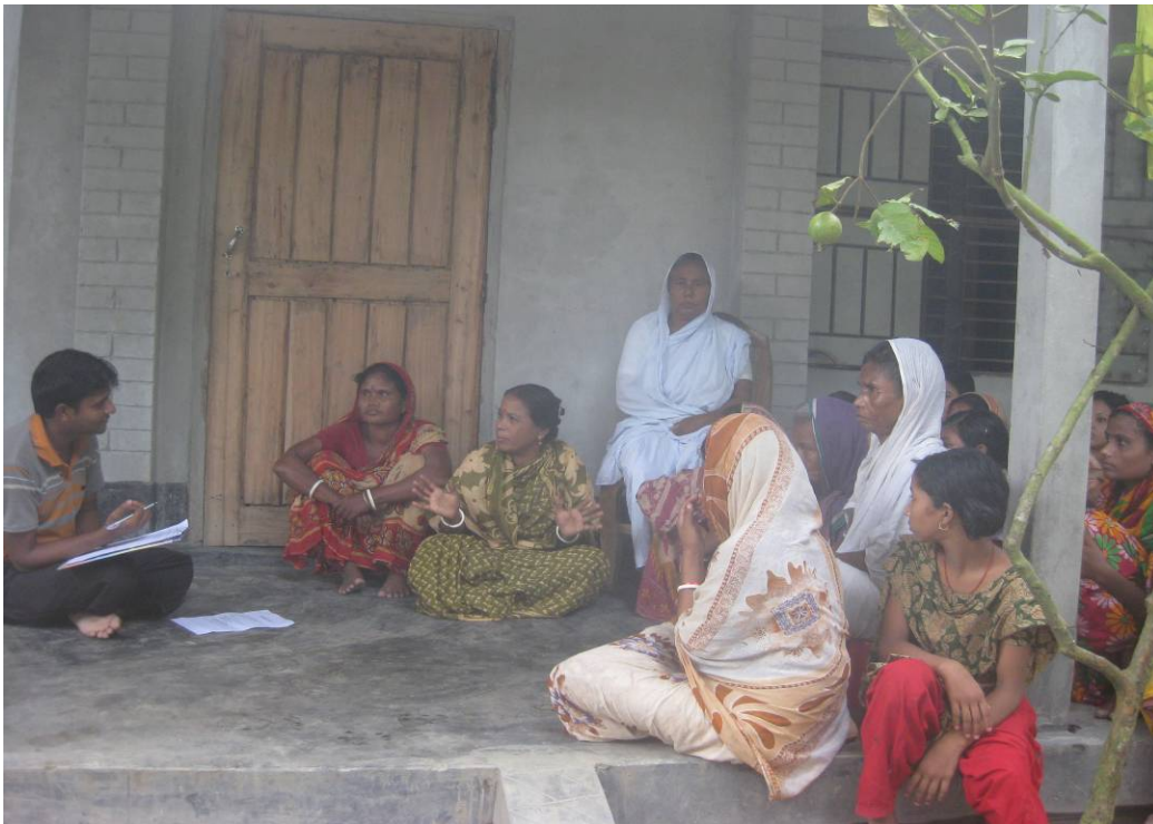
Photo: Focus Group Discussion with Religious Minority at Kurigram district