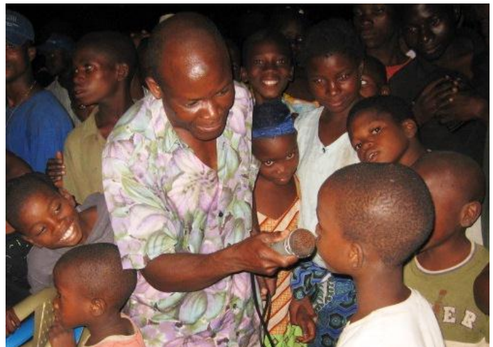
Figure 5: A reluctant boy expressing his point in the discussion portion of the mobile unit presentation in Nampula.

Discussion - The young children did not appear comfortable speaking in public with the adult audience. The setting and timing of the presentation was also not appropriate: the children were seated in front of the community assembly; it was night time and already dark. They were unnecessarily exposed to the elements and to mosquitoes and malaria, which incidentally was the topic being discussed. If there are messages for the children, there are surely other ways of delivering the same in a more suitable place and time. There are also other creative ways for meaningful child participate in other stages of the mobile unit activities even if they are not in attendance in the actual presentation.