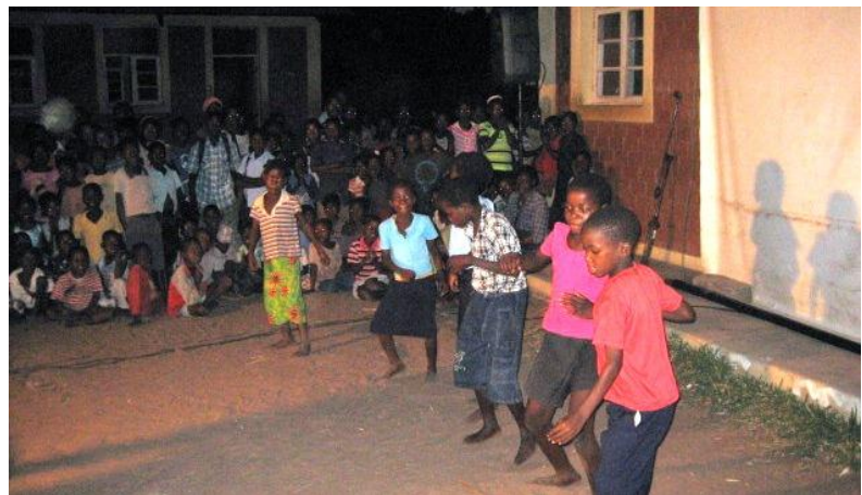
Figure 6: Children in Gaza dancing to an adult-oriented music before a mobile unit presentation began in Gaza.

The actual mobile unit presentation starts late afternoon in a vacant lot in the community. In Gaza and Nampula, children sat in front of the community gathering facing the projection screen. The adults sat at the back. The program began with a children’s dancing contest before the actual presentation. The audience was visibly entertained by four groups of 5 girls and boys contestants who danced to adult-oriented music. The audience decided the winners. The prizes: notebooks and other school supplies.