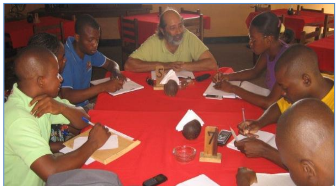
Figure 4: Youth leaders in Zambezia in an FGD with the evaluation team.

The youth leaders engaged in some monitoring as they went about their work in the council, citing their regular meetings to discuss their plans and progress, although they were not aware of