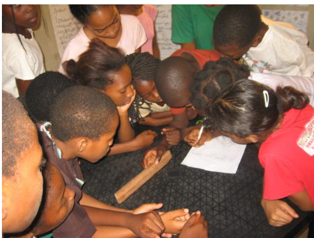
Figure 2 - Members of Bradas Club in Escola Primária Completa Ngungunhana in Chibuto, Gaza seriously engaged in planning their next activity in school.

The children in Chibuto met regularly during the week and weekends to plan their activities and prepare and rehearse their performances. The teacher-coordinator said she made it a point to be present during each meeting and performance. In the specific case of Chibuto, the team actually observed that the children themselves were actively engaged in the planning exercise, as well as with the execution of the activities.