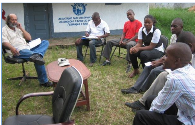
Figure 3: Youth Leaders in Nampula in an FGD with the evaluation team.

The officers of the provincial councils, CPJs, met by the evaluation team showed low capacity to assess and analyze the situation of the youth sector in the province. During the focus group discussions, they identified issues and concerns that are a popular refrain in any discussion, such as housing, employment and educational opportunities. The evaluation team attempted to facilitate and draw out the social issues affecting the youth from their perspective as a sector. If the council officers also have some of their focus on the general social realities of Mozambican youths, it would have been easy for them to identify and debate on the issues. This was not the case. The youth needed repeated prompting and indeed it was only when the team mentioned drug addiction, alcoholism, risky behaviour, as examples, did they begin to mention related problems such as early marriages, unwanted pregnancy, sexual abuse, out-of-school youth, etc.